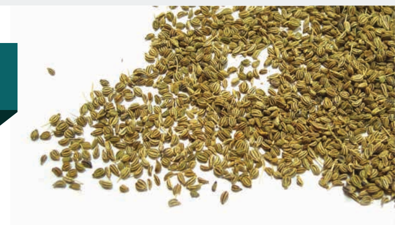
which is not sufficient to meet the demand till the next crop. ASTA quality has been traded around $2.25/kg at the market while extraction quality is offered at $1.80/Kg. Prices likely to continue firm due to limited availability.

Market remained firm as carryover stocks are thin,