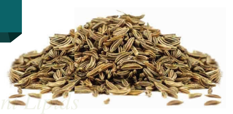
Prices slightly eased with limited demand. Current price for ASTA grade is $2.4/Kg.

New crop sowing has almost finished in Gujarat and Rajasthan, the major producing states in India. The attractive prices prevailing in the present season has prompted the farmers to increase the area under cultivation by 20%. At present climate is favourable for the crop.