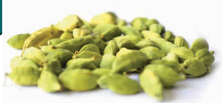
Prices of various grades were 7-8 mm (AGEB) Rs.700-740/Kg; 6-7 mm (AGB) Rs.600-640/Kg; 5-6 mm (AGS) 550-600/Kg.

Cardamom prices slightly eased on sluggish demand. This year production is higher than that of last season. The current season has begun from August and the total arrivals during the season stood at 18621 MT. Price is likely to remain steady in the short term.