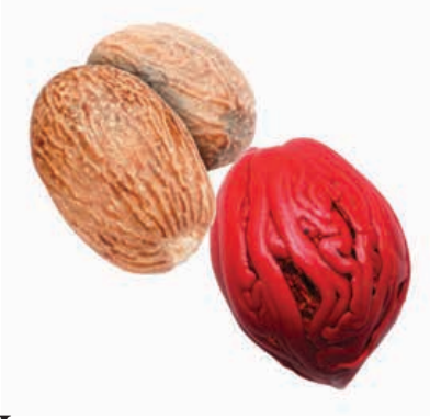
In Sri Lanka, limited arrivals are there for the extraction grade material due to off season. Current quote for BWP grade is at $3800/MT

Arrivals reduced in the market centres in India as crop season has finished. Prices slightly up as compared to last month. Superior grade Mace in the domestic market is at Rs.1200/Kg and farm grade nutmeg with shell is trading at Rs.325/Kg while that of export grade is sold at Rs.350/Kg. Without shell Nutmeg is quoting at Rs.550/Kg and that of export quality ABCD grade is at Rs.575/Kg.